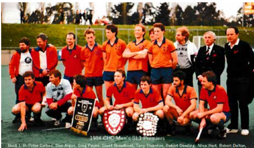
1984 CHC Men's SL1 Premiers