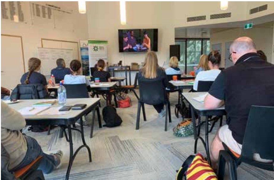
Mental Health First Aid Course at Matlock

share the loss of routines, connectedness and networks at CHC. The pandemic has heightened mental health issues across the community as a whole.